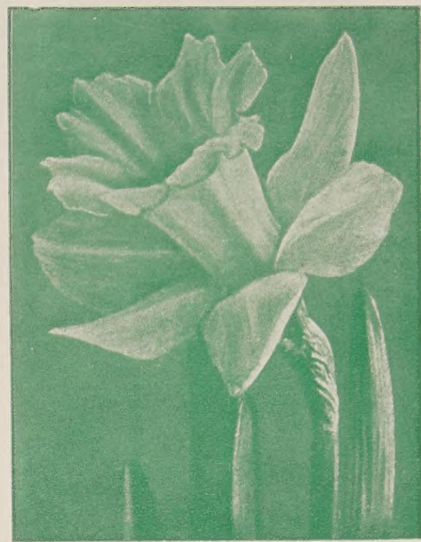
Giant Trumpet Daffodil

BULB TERMS:—Bulb and Root prices include delivery in U. S. A. Not less than six bulbs supplied at dozen price and 25 at the 100 rate.